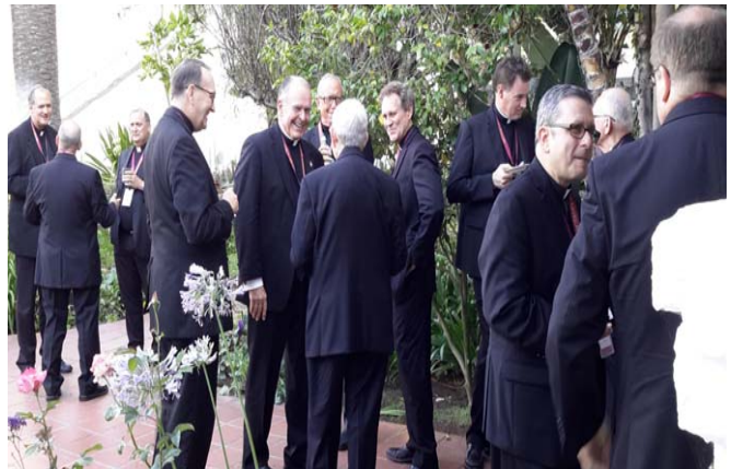
SOCIAL HOUR AT MISSION SAN DIEGO