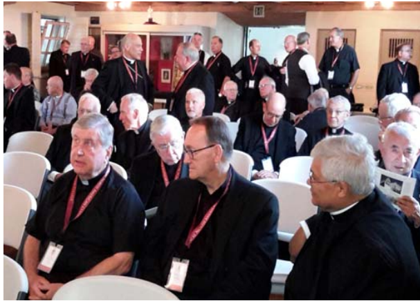
WEDNESDAY BUSINESS MEETING