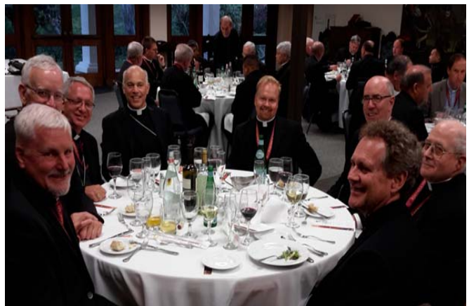
ENJOYING THE WEDNESDAY NIGHT BANQUET