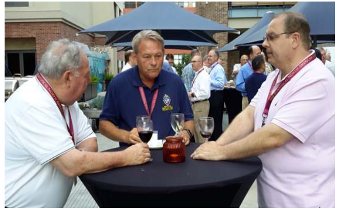
ALUMNI ENJOYING TUESDAY NIGHT MIX