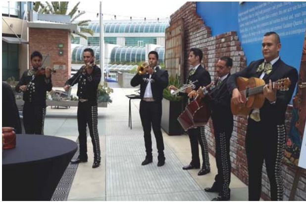
MIRIACHI BAND AT TUESDAY NIGHT MIX