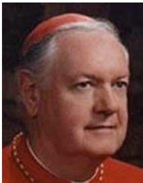
H. E. Edward Cardinal Egan Class of 1958

He is now the 13th Bishop and 10th Archbishop of the See of New York, succeeding His Eminence, Edward Cardinal Egan on April 15, 2009. Archbishop Dolan was the Rector of the Pontifical North American College from 1994 to 2002.