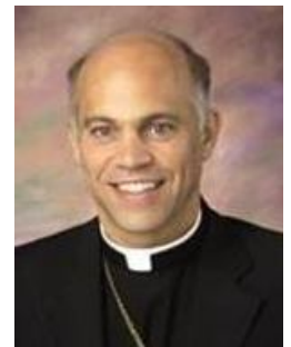
Archbishop Timothy M. Dolan Archbishop of Milwaukee Class of 1976