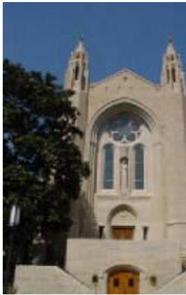
Christ the King Cathedral Atlanta

This event opens celebrations for the 150th Anniversary of the founding of the College. Archbishop Wilton Gregory sent letters of invitation to all alumni in March, 2009. The headquarters of the One-Hundred-Twentieth Alumni Reunion is Buckhead Marriott Hotel in Atlanta;