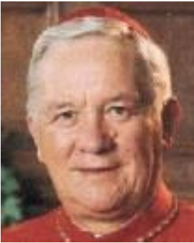
H. E. Adam Cardinal Maida CSM 1960

Retired as Archbishop of Detroit January 28, 2009