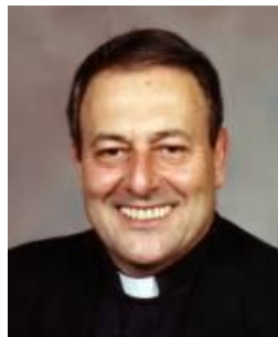
Bishop Salvatore Cordileone Class of 1982